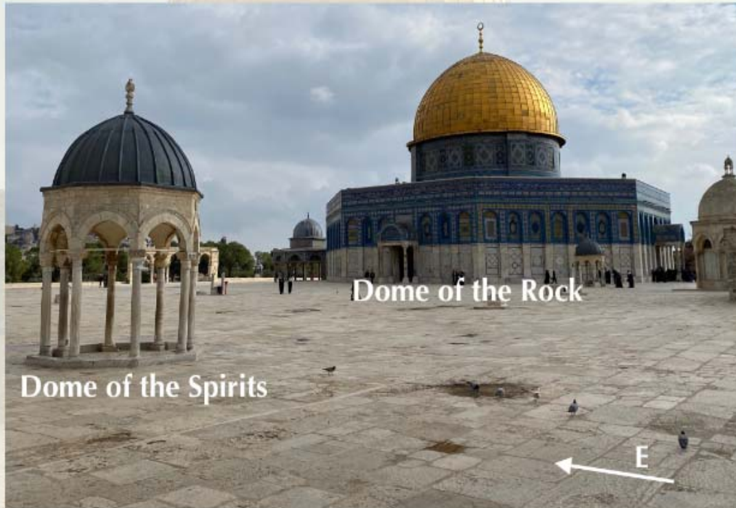
Dome of the Spirits