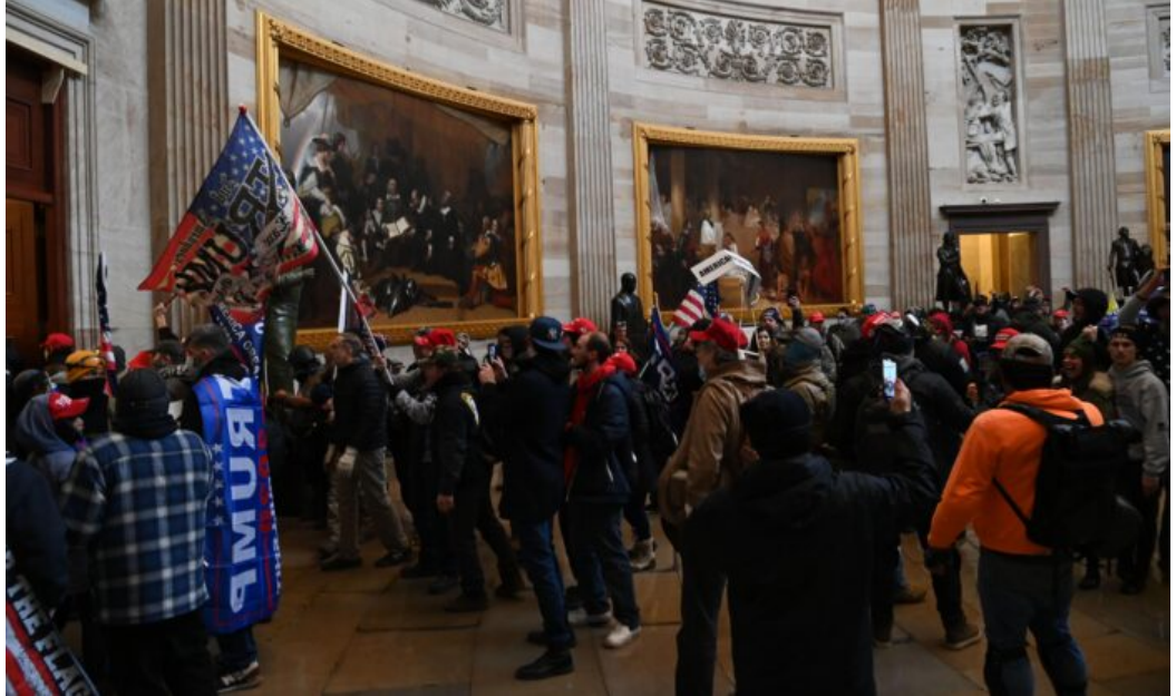
A group of protesters enter the U.S. Capitol's Rotunda in Washington on Jan. 6, 2021.